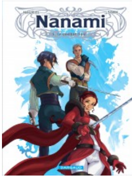
Le Combat final