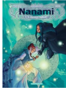
Le Royaume invisible