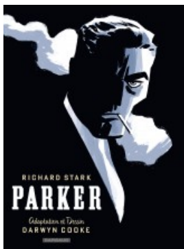
Parker - Intégrale complète