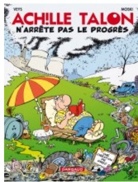
Achille Talon n'arrête pas le progrès