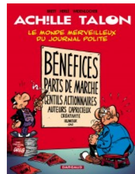
Le Monde merveilleux du journal Polite