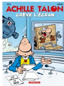
Achillon Talon crève l'écran