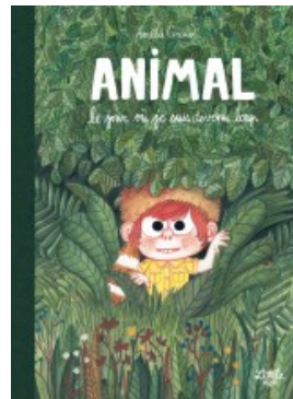
Animal le jour où je suis devenu loup