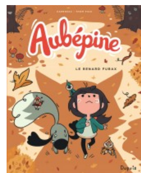
Le renard furax