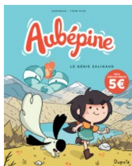
Le Génie Saligaud