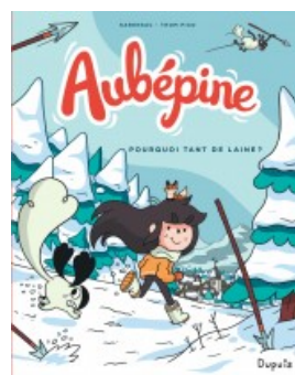
Pourquoi tant de laine ?