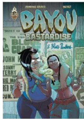
BAYOU BASTARDISE T02 - BLUES PANTHERS