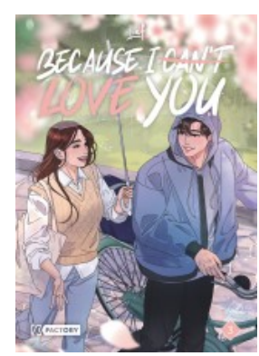
Because I can't love you tome 3