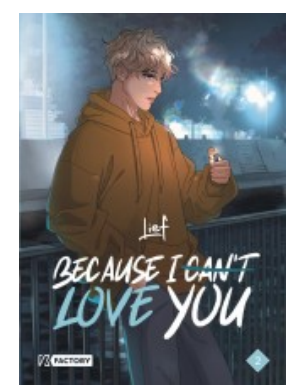
Because I can't love you tome 2