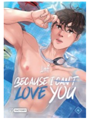
Because I can't love you tome 4