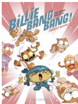
Contre les machans