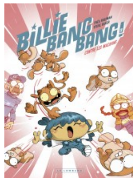
contre les machans