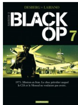
Black Op - tome 7