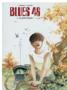
Allegro Furioso !