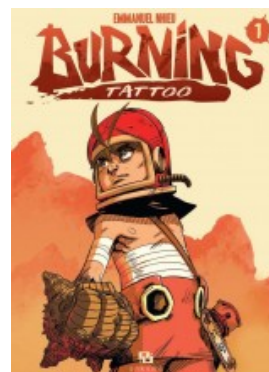
BURNING TATTOO T01