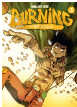
BURNING TATTOO T03