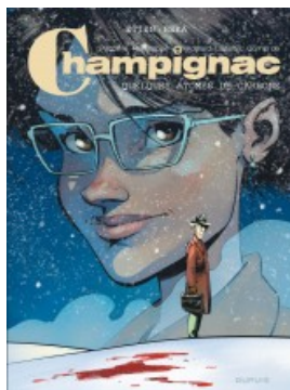
Quelques atomes de carbone