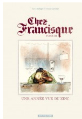
Une année vue du zinc