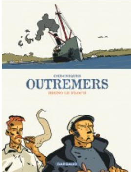
Chroniques outremers - Intégrale complète