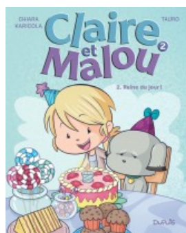
Reine du jour !