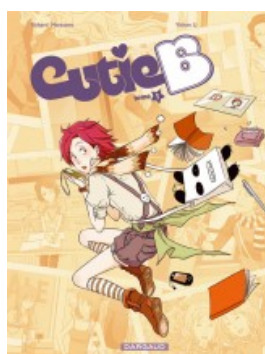
Cutie B. - tome 1