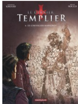
Le Chevalier manchot