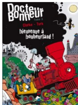
Bienvenue à bonheurland !