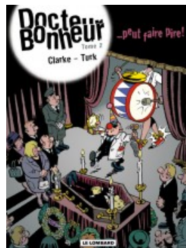
...peut faire pire