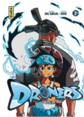
Droners - Tales of Nui T2