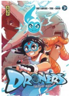
Droners - Tales of Nui T3