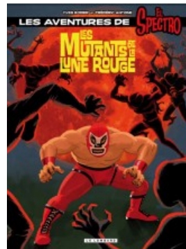
Mutants de la lune rouge (Les)