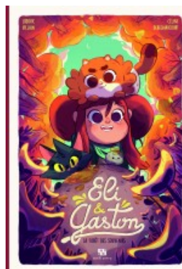
Eli & Gaston - La Forêt des souvenirs