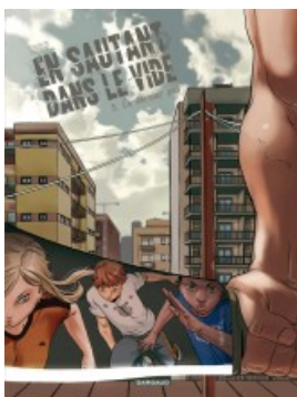
Le dernier pas