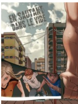
Le dernier pas