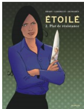
Plat de résistance