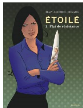
Plat de résistance