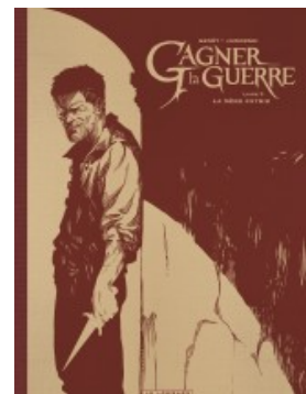
La Mère patrie