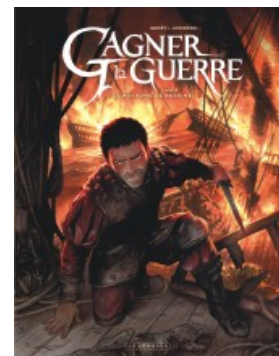
Le Royaume de Ressine