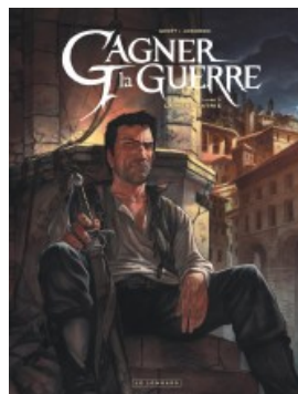
La Mère patrie