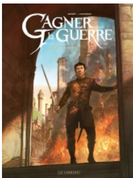
Retour en grâce