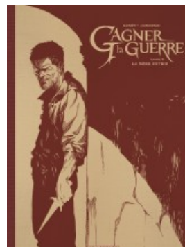
La Mère patrie