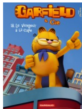
Le Vengeur à la cape