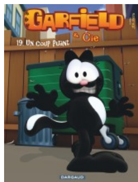
Un coup puant