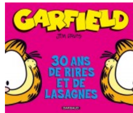
Garfield 30ème anniversaire