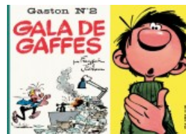
Gala de gaffes