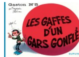
Les gaffes d'un gars gonflé