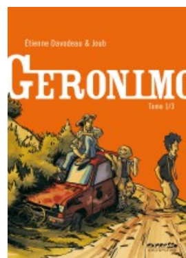
Geronimo - tome 1/3