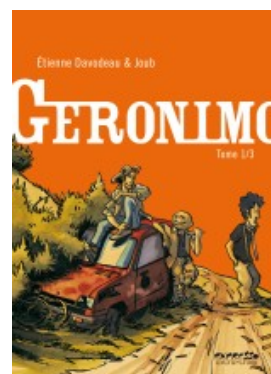
Geronimo - tome 1/3