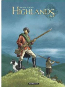
Highlands - Intégrale complète