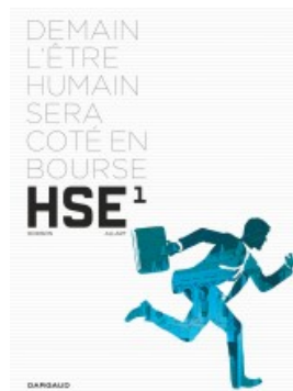
H.S.E. - tome 1