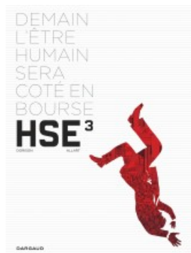
H.S.E. - tome 3