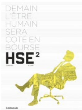
H.S.E. - tome 2