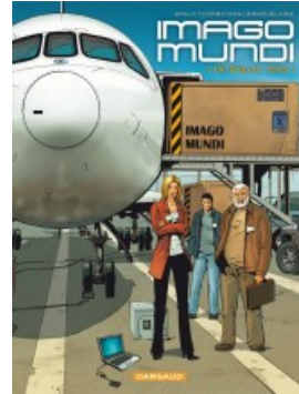
Imago Mundi intégrale 1