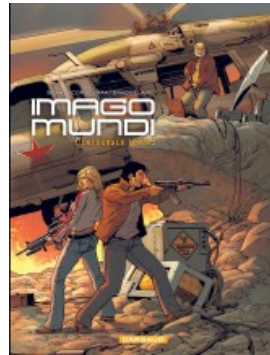
Imago Mundi intégrale 2