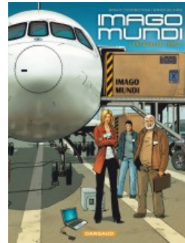
Imago Mundi intégrale 1