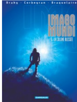
Colline blessée (La)