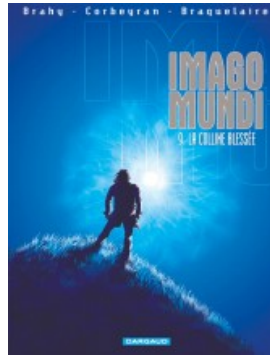
Colline blessée (La)