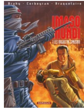
Orgues de Simushir (Les)