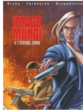
Héritage Jomon (L')