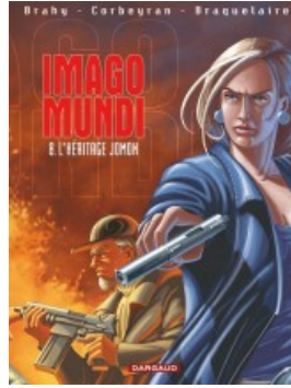
Héritage Jomon (L')