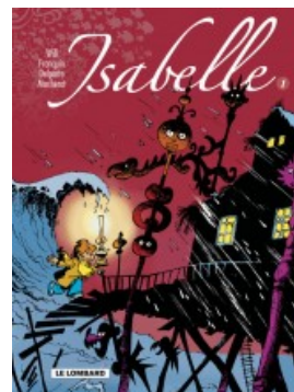
Isabelle - Intégrale T1