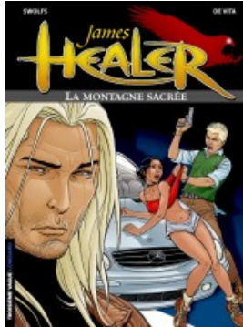
La Montagne sacrée