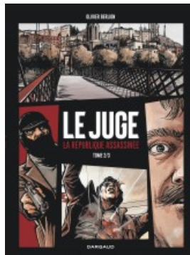
Le Juge la République assassinée - tome 2