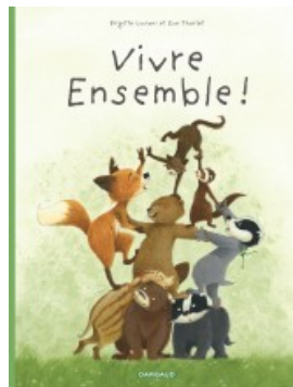
Vivre ensemble !