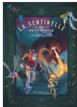
Les larmes du dragon