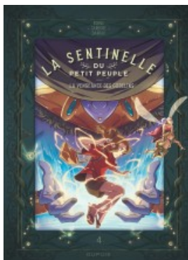
La vengeance des Gobelins