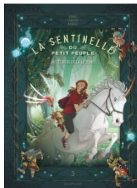
Au secours de la licorne