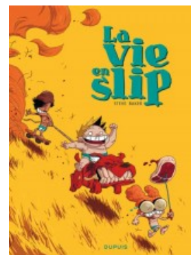
La vie en slip - tome 1