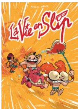
La vie en slip tome 1