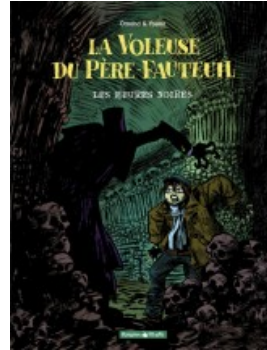
Les Heures noires