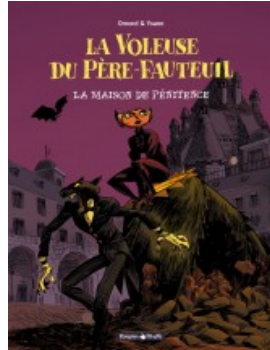
La Maison de la Pénitence