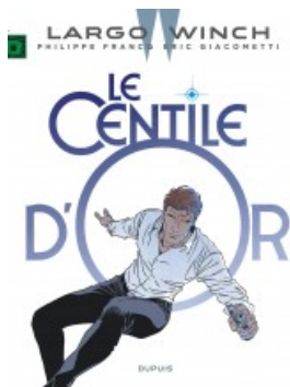
Le Centile d'or