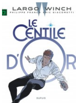
Le Centile d'or