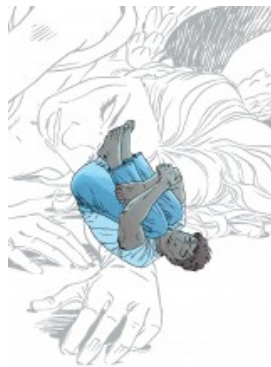
La frontière de la nuit