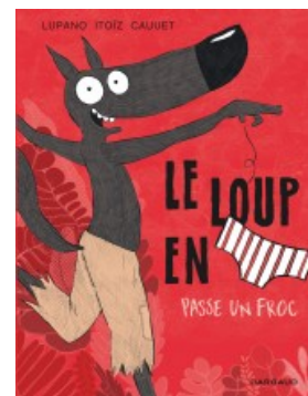
Le Loup en slip passe un froc