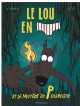
Le Loup en slip et le mystère du P silencieux