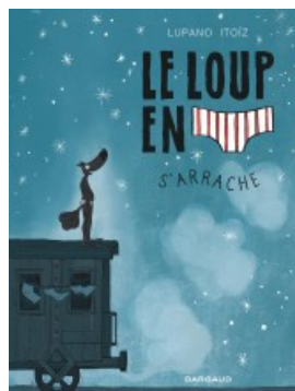
Le Loup en slip s'arrache