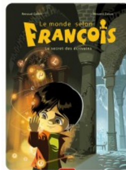
Le secret des écrivains