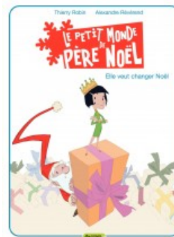
Elle veut changer Noël