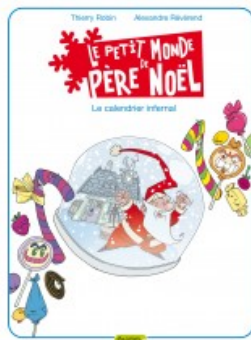
Le calendrier infernal