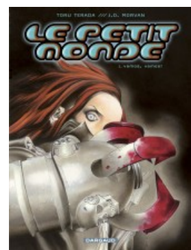
Vamos vamos !