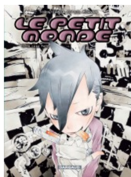
La Casa feliz