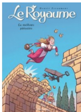
La meilleure pâtissière