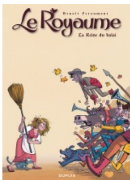
La Reine du balai