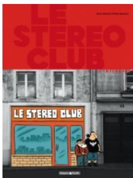
Le Stéréo Club - Intégrale complète