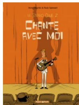
Chante avec moi