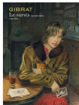
Le Sursis tome 2