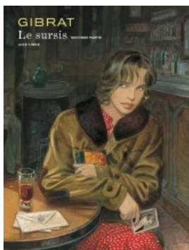
Le Sursis tome 2