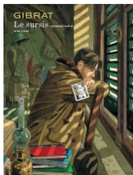
Le Sursis tome 1