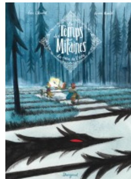
La Peau de l'ours