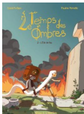
L'Été de feu