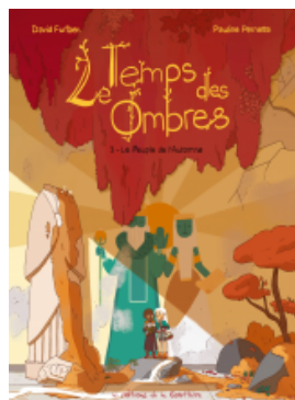
Le Peuple de l'Automne